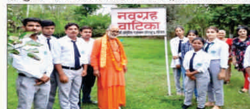
प्राथम्य पूजा की