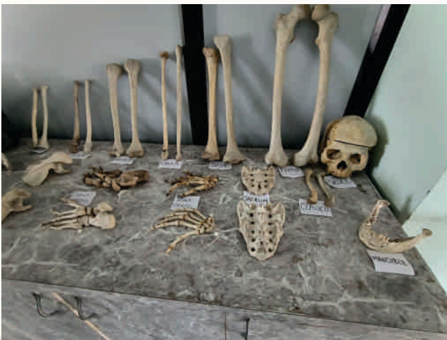
Rachna Sharir Museum