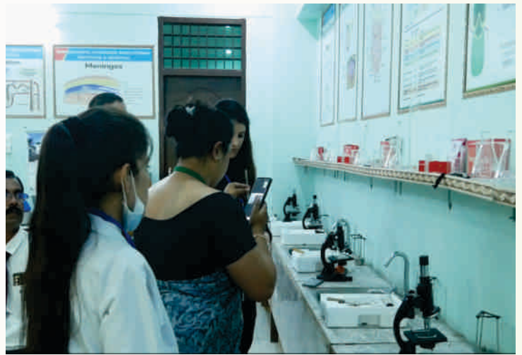
Kriya Sharir Lab