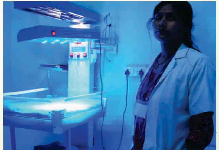
Neo Netal Care