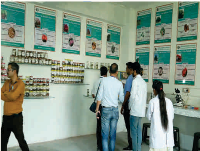
Dravya Guna Dep.