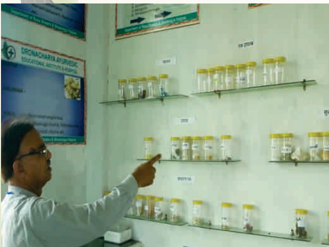
Rasa Shastra Dep.