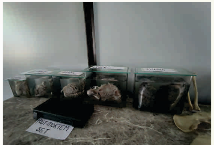
Rachna Sharir Museum